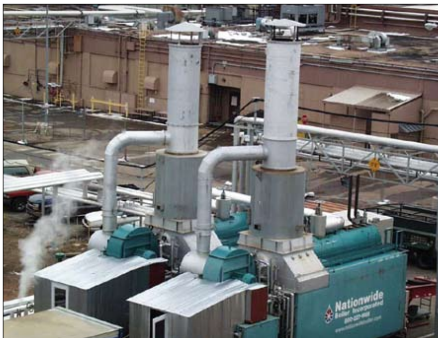
(2) Nationwide Boiler 70,000 lb/hr 300 psig mobile boilers with EconoStaks installed for increased fuel efficiency and lower GHG emissions.

EconoStak is a cost-effective, economical solution for increasing energy efficiency.